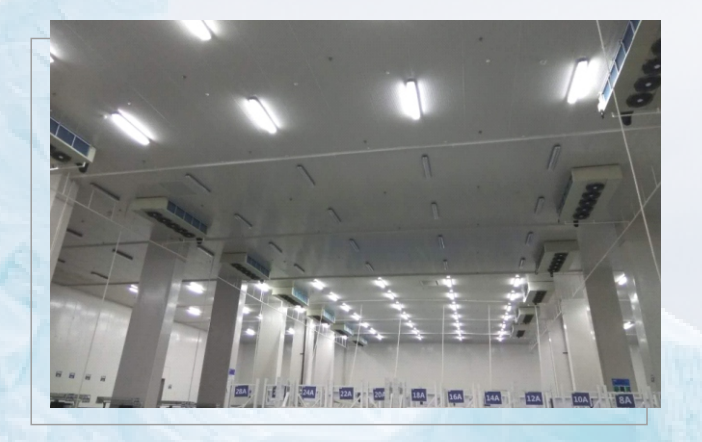
6,000 square meters of low-temperature storage with a storage height of 8.7 meters (-20°C)